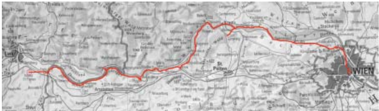
The tour from Linz to Vienna

Further departures on request for a minimum of 8 passengers